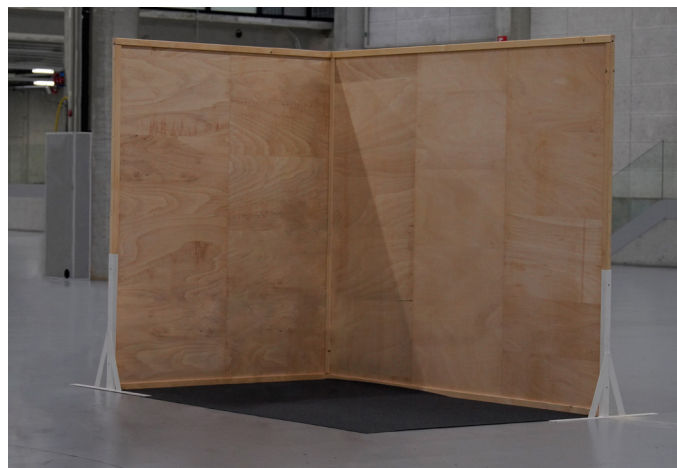
Example: BASIC, 6 m 2 corner booth